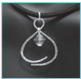
Above: One of two “Mother's Love” pendant designs, made with non-tarnishing silver. The pendants will be given to mothers who attend ANA's Memorial Walk on 10/15/11.

For more information visit Beachin' Baubles on Facebook or at www.beachinbaublesjewelry.com .